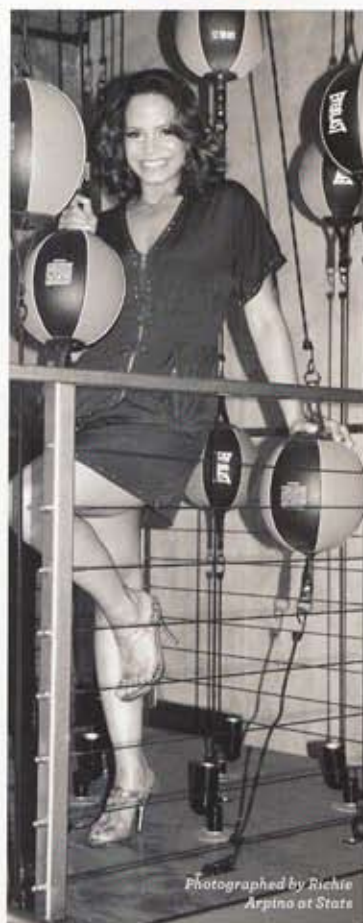
Photographed by Richie Arpino at State